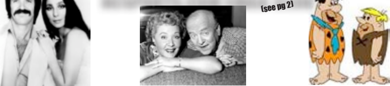
(see pg 2)

GET ONE ISSUE ABSOLUTELY FREE BY JOINING THE NCSPTS.COM EMAIL CLUB